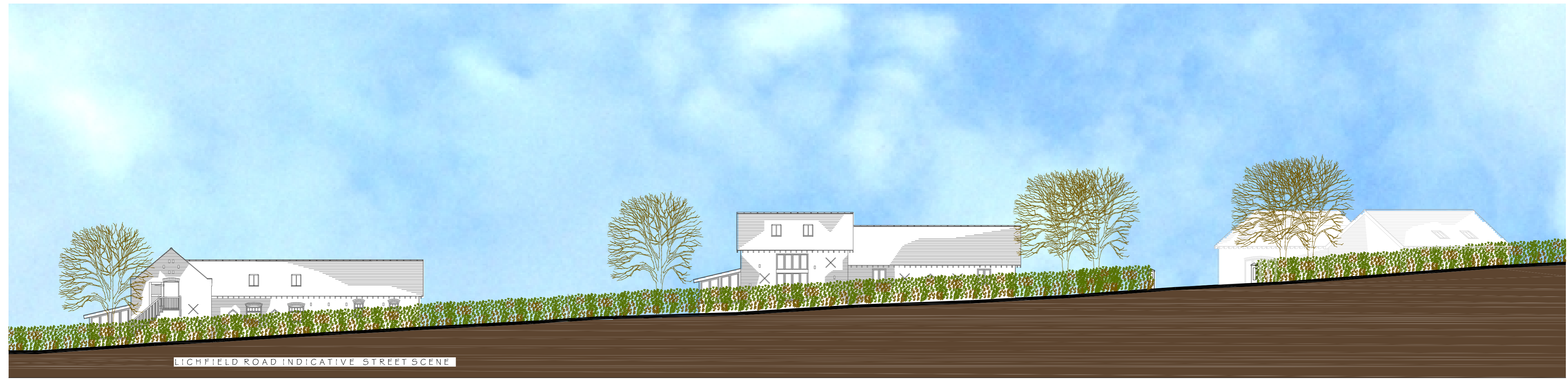
LICHFIELD ROAD INDICATIVE STREET SCENE